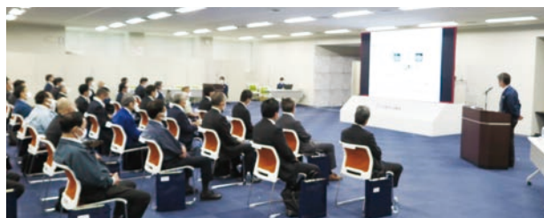
Purchasing Policy explanation

Every April, we hold a supplier meeting for our major suppliers. Through explanations of the business environment, group policy, and basic purchasing policy, we share and deepen collaboration on various activities and goals, such as safety and disaster prevention, CSR, quality assurance, reinforcement of our foundations, and strengthening competitiveness. We also praise and present awards to suppliers who have achieved outstanding results with regard to quality and cost reduction.