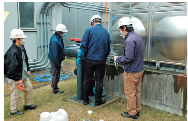
Drills for emergency response

In FY 2022, there were no environmental abnormalities or complaints.