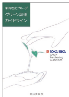
Green Procurement Guidelines

Tokai Rika and its overseas bases have established Green Procurement Guidelines to understand the concept of environmental conservation, and are strengthening environmental management globally. In addition, we conduct hearings through on-the-spot inspections and provide improvement support to member companies of the Kyouryoku-kai organized by suppliers to improve the levels of both the Tokai Rika Group and our suppliers.