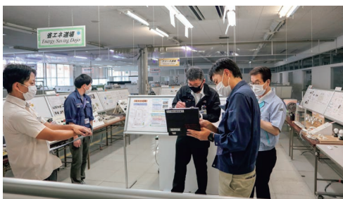
Education that accepts suppliers

We will make the "Energy-saving Dojo", an opportunity for training key energy-saving personnel in the company, available to our suppliers to pass on our energy saving know-how. We will work together to achieve carbon neutrality throughout our supply chain.