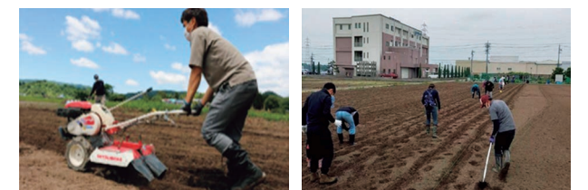
Maintenance of abandoned farmland

We carried out activities with the aim of resolving local issues (village maintenance, restoration of old roads, wildlife control) in Minatomachi, Aizuwakamatsu City, Fukushima. At the same time, we maintained abandoned farmland and sowed seeds such as sunflowers in order to improve the landscape and prevent damage from wild animals.