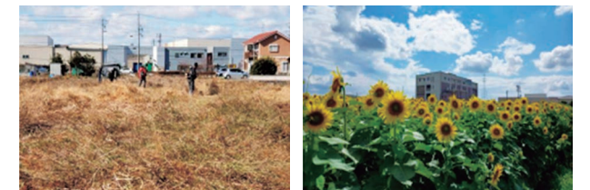
Abandoned farmland (before our activity)