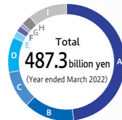
Net sales by product category