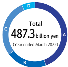
Net sales composition ratio