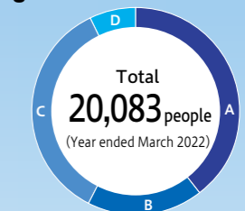
Number of employees by region for FY 2022