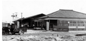
Nishibiwajima Plant at the time of foundation