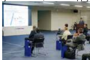
FY 2021 Purchasing Policy explanation

Every April, we hold a supplier meeting for our major suppliers. Through explanations of the business environment, group policy, and basic purchasing policy, we share and collaborate on various activities and goals, such as safety and disaster prevention, quality assurance, stable supply, competitiveness, and compliance. We also praise and present awards to suppliers who have achieved outstanding results with regard to quality, cost, stable supply, and so on.