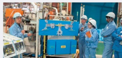
Joint study session with suppliers