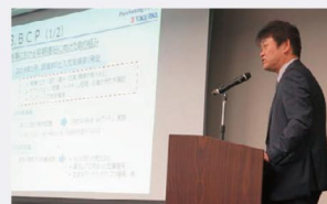
FY 2019 Supplier meeting

Our Purchasing Div. positions painting processes, casting processes, substrate mounting processes, semiconductor processes, and power receiving/transforming facilities as the main areas for disaster prevention, and conducts joint inspections of facilities in cooperation with suppliers and in-house dedicated committees. In FY 2019, as well, we conducted joint inspections on the status of management at a total of 60 suppliers in the field of painting processes, casting processes, substrate mounting processes, semiconductor processes, and power receiving/transforming facilities management on the basis of the activity plan.