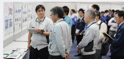
A scene at Tokai Rika Kyouryoku-kai Quality improvement exhibition