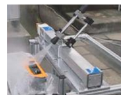
Water resistance test simulating high-pressure cleaning of power window switch

We are working to ensure that we provide safer products to customers, by obtaining market information from around the world and conducting our own original tests and evaluations for “ways the products are used” that we were unaware of, in addition to customer requirements.