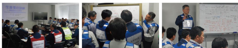
A scene of a production recovery trial

We will continue to develop human resources who have the ability to adapt to disasters and improve the level of our overall business continuity plan (BCP).