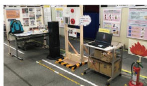
Disaster prevention dojo