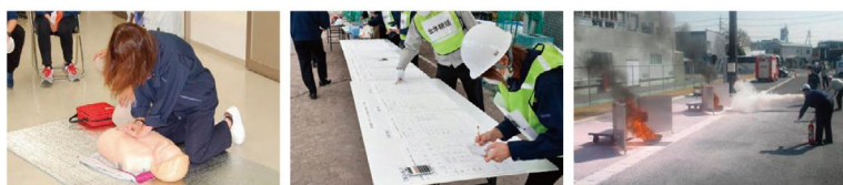
CPR and AED training

We are also working with all employees in order to raise their awareness of emergencies.