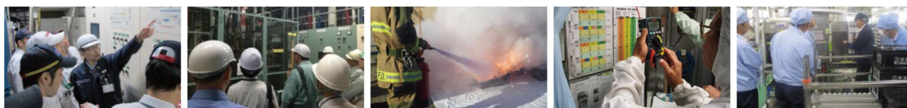
Semiconductor dedicated committees

We implement periodic disaster prevention audits through specialized committees for each process (five main fields), consisting of officers and relevant departments; we are striving to increase awareness of disaster prevention by conducting practical drills, holding study sessions, and more. We also prevent recurrence of accidents that occur in Tokai Rika Group so that they will never occur again.