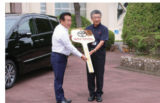
Donation to Oguchi Town

As a part of the memorial events in which we celebrated the 70th anniversary of the company, commemorative gifts were specially donated to cities, towns, and villages where the Head Office and each plant are located, in order to express our gratitude to the communities. Upon selecting gifts, we surveyed the request of each municipality and we presented an ESTIMA HYBRID to Oguchi Town, an assisted-transfer bath systems to Toyota City, and an all-weather drone to Toyokawa City.