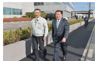
The completed pedestrian walkway

As a cooperative project with Oguchi Town, we lent a part of our company's land to the town for free to use it as a pedestrian walkway for traffic safety.