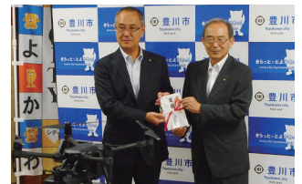
Donation to Toyokawa City