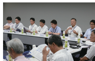
Head Office Area

At each office in Japan, we hold an annual local social gathering by inviting representatives in neighboring regions. We explain our business activities such as social contribution activities, environmental maintenance activities, and volunteer activities conducted by employees.