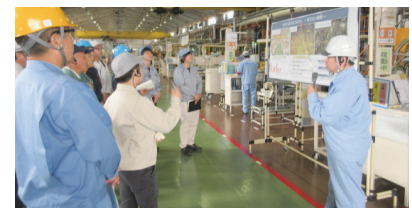
Joint study session led by casting suppliers

Our Purchasing Div. positions painting processes, casting processes, substrate mounting processes, semiconductor processes and power receiving/transforming facilities as the main areas for disaster prevention, and conducts joint inspections of facilities in cooperation with suppliers and in-house dedicated committees. In FY 2018 as well, we conducted joint inspections on the status of management at a total of 60 suppliers in the field of painting processes, casting processes, substrate mounting processes, semiconductor processes and power receiving/transforming facilities management on the basis of the activity plan.