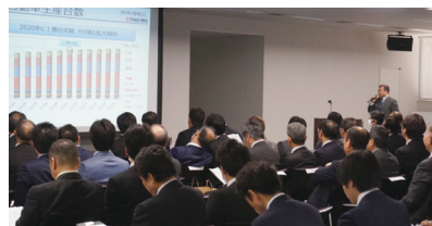
FY 2018 Supplier meeting

On April 12, 2018, we held a Supplier meeting at our Head Office. With about 130 suppliers from among our main suppliers in attendance, including 50 suppliers of Tokai Rika Kyouryoku-kai, among 400 parts suppliers, we explained on our group policies, purchasing policy, and also our policy regarding quality, and initiatives with regard to environmental activities, and more.