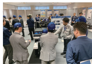
Facility tour for institutional investors and analysts

In addition, we conducted a facility tour in December 2018, for which we invited institutional investors and analysts to our company. They confirmed our initiatives for semiconductors in which direction our development is headed.