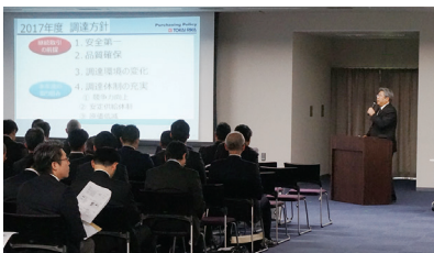
FY 2017 Supplier meeting

On April 14, 2017, we held a Supplier meeting at our Head Office. With about 130 suppliers from among our main suppliers in attendance, including 51 suppliers of the Tokai Rika Kyouryoku-kai among 400 parts suppliers, we explained on our group policies and purchasing policy and on quality policies, and enhancements to initiatives with regard to environmental activities in response to customer requests.