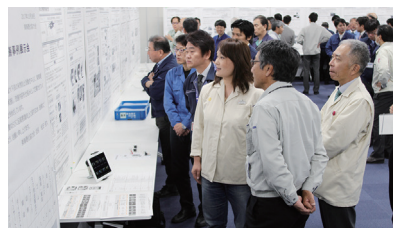
Tokai Rika Kyouryoku-kai Quality improvement exhibition

With a view to achieving cross-industrial exchange as well, we have divided the 51 suppliers of the Tokai Rika Kyouryoku-kai into three groups, namely, "safety," "quality" and "personnel and labor affairs," and have been conducting section meeting activities every other month. Through these activities, we are working toward mutual improvement in each field, by introducing actual examples from both within and outside our company. These examples include ones related to "safety," "quality" and "personnel and labor affairs," and by introducing things such as information on changes to laws and ordinances pertaining to "environment" and actual examples of environmental near-misses.