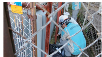
Power receiving/transforming facilities inspection

Our Purchasing Div. positions painting processes, casting processes and power receiving/transforming facilities as the main areas for disaster prevention, and conducts joint inspections of facilities in cooperation with suppliers and in-house dedicated committees. In FY 2017 as well, we conducted joint inspections on the status of management at a total of 21 suppliers in the field of painting processes, casting processes and power receiving/transforming facilities management on the basis of the activity plan.