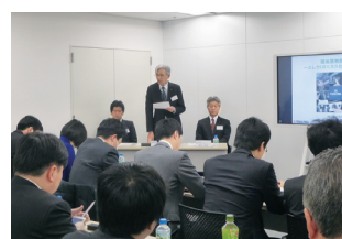
Facility tour for institutional investors and analysts

In addition, we conducted a facility tour in December 2017, for which we invited institutional investors and analysts to our company. They confirmed how our electronics department has been strengthened and in which direction our development is headed.