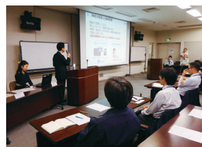
Lecture given by external lecturers

Also, we revised the Guide to Confidentiality Control in December 2017. The guide explains everything from the definition of confidentiality to how to respond in the event of an incident, in an easy-to-understand manner with illustrations.