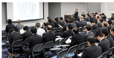
Tokai Rika Group Policies and Procurement Policy Briefing

On April 7, 2016, we held a "Tokai Rika Group Policies and Procurement Policy Briefing" at our Head Office. With about 130 companies from among our main suppliers in attendance, including the 51 companies of the Tokai Rika Association, we conducted a briefing on our group policies and procurement policy, and also on quality prevention activity reports, quality function policy, and enhancements to initiatives with regard to environmental activities in response to customer requests.