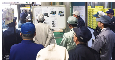
Association section meeting activities

With a view to achieving cross-industrial exchange as well, we have divided the 51 companies of the Tokai Rika Association into 5 groups, and have been conducting section meeting activities every other month. Through these activities, we are working toward mutual improvement in each field, by introducing actual examples from both within and outside our company, including ones related to "safety" and "quality," and introduce things such as information on changes to laws and ordinances pertaining to "environment" and actual examples of environmental near-misses.