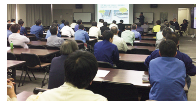
Power receiver/transformer disaster prevention briefing

Our procurement department focuses on painting, casting processes and power receiving/transforming facilities as the main areas for disaster prevention, and conducts joint inspections of facilities in cooperation with suppliers and in-house dedicated committees. In FY 2016 as well, we conducted study sessions for 50 supplier companies with regard to the management of power receiving/transforming facilities, the appropriate storage and disposal of PCBs, and being prepared for earthquakes.