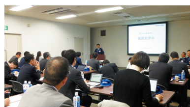
Facility tour for institutional investors and securities analysts

In addition, we conducted a facility tour in December 2016, for which we invited institutional investors and security analysts to our company and got them to confirm the status of our work on quality and the development of our next products, using the Genchi-genbutsu ("actual place and actual thing") method.