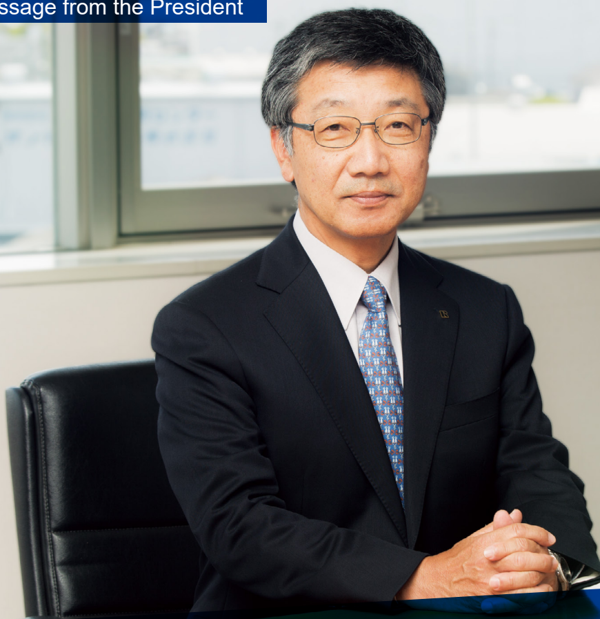
President of TOKAI RIKA CO., LTD