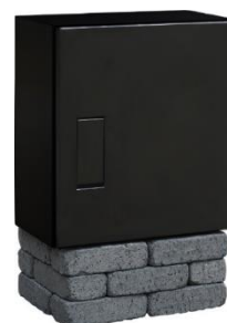
RusuPo with FREEKEY (provisional name)