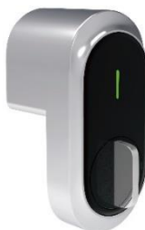
Attaching the lock:

The FREEKEY Lock is a smart phone-operated electronic lock that eliminates the need for physical keys. It works with various doors, including the front doors of homes.