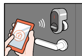
Lock and unlock using a smart phone.